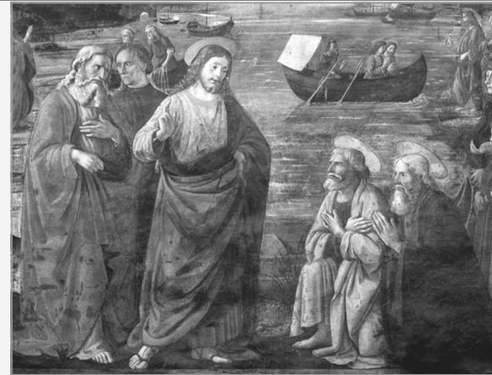
The Calling of St. Peter and St. Andrew, by Ghirlandaio