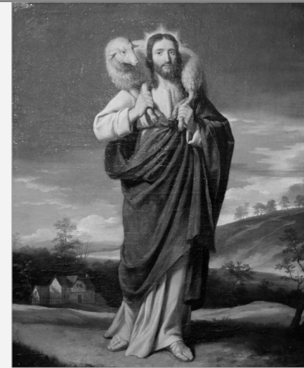
Le Bon Pasteur by Philippe de Champaigne