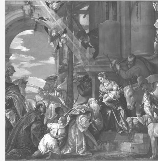
Adoration of the Magi by Paolo Veronese